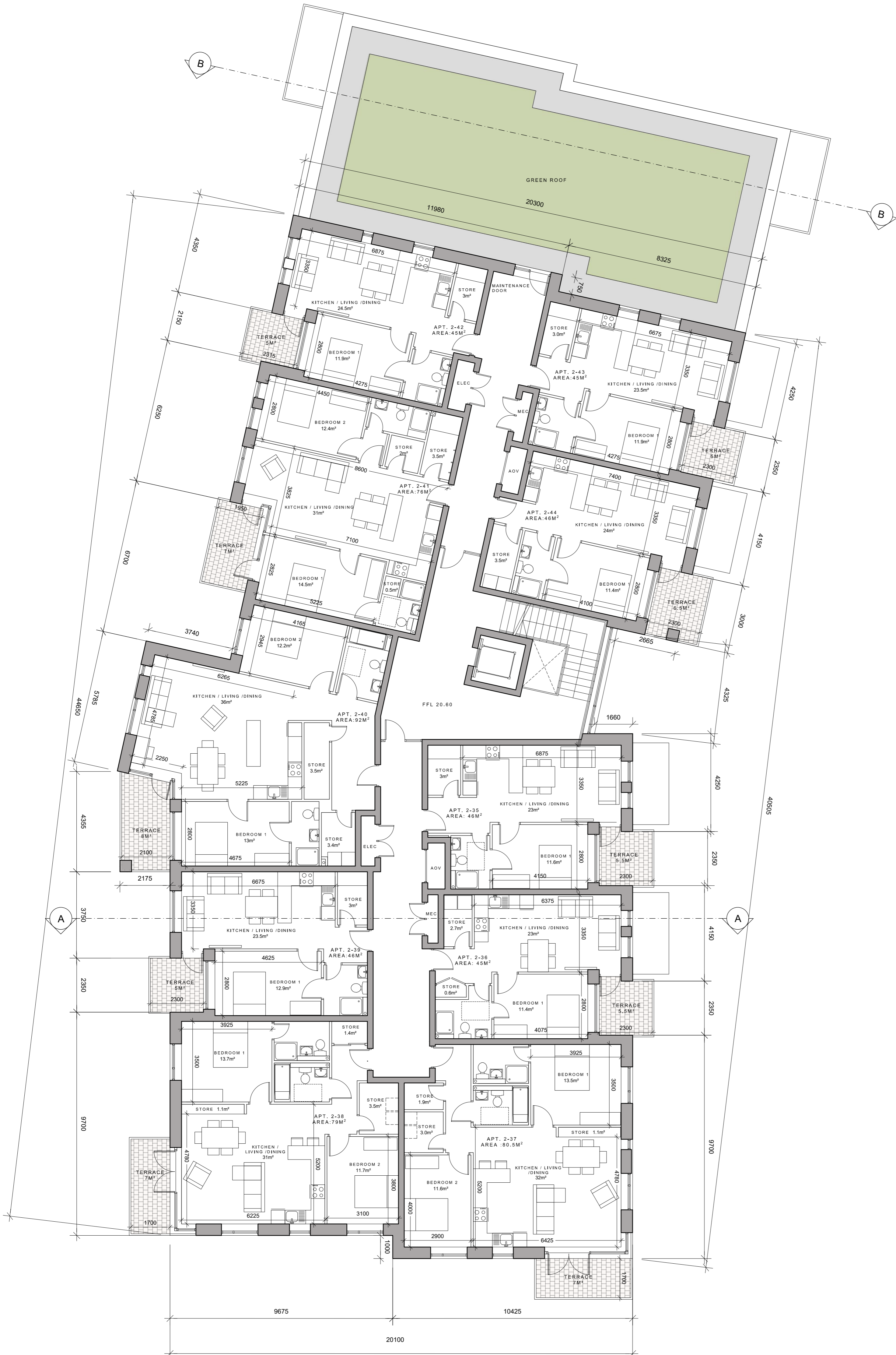
BLOCK 2 THIRD FLOOR PLAN SCALE: 1:100